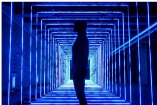
A preview earlier this month of the Canary Wharf Winter Lights exhibition